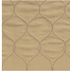
Thermal Barrier: Defender® M NP Brass