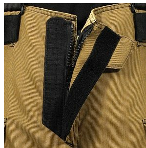
Vislon® Zipper Closure On coat and pants.