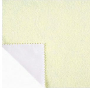
Moisture Barrier: RT 7100 – Type 3D