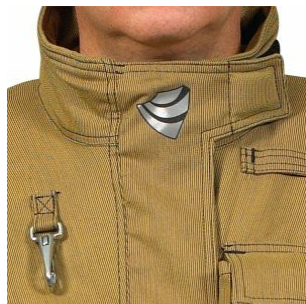
Variable Height Collar All-around protection with 4" back transitioning to 3" front. (US Patent 8 151 371)