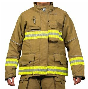
Basic Configuration 32" style coat / Regular waist pant NFPA style Scotchlite® 3" Segmented (triple trim) Zip-in liner attachment Retractable Action Back™