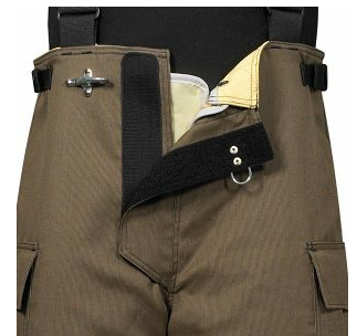
Hook & Dee closure on pants