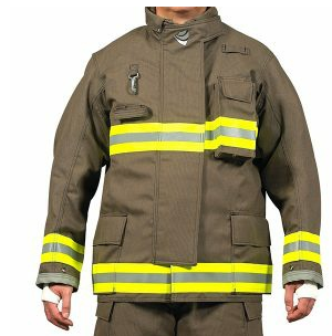
Brass Zipper closure on coat