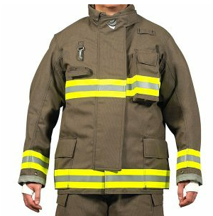
Basic Configuration 32" style coat / regular waist pant NFPA style 3M Scotchlite® 3" triple trim