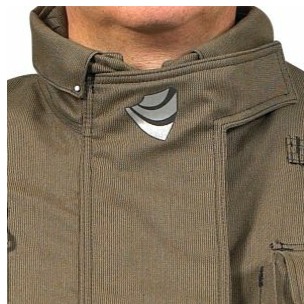
3" BR-1 Collar Patented BR-1™ collar – 3" – INNO5000™ Series – 4 layers (US Patent 6 481 018)