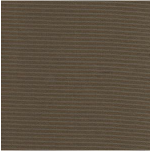
Outer Shell: Pioneer™ Khaki