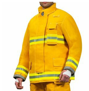
Brass Zipper closure on coat