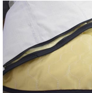
Inspection port On coat and pants.