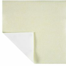
Moisture Barrier: Stedair® 3000