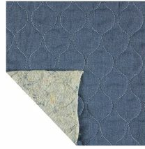
Thermal Barrier: Q-8™