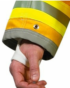
White Nomex wristlet with thumb hole