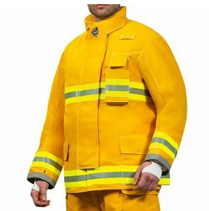
Basic Configuration 32" style coat / regular waist pant NFPA style 3M Scotchlite® 3" triple trim Snap-in liner attachment