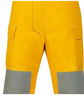
10" x 10" Semi Bellow Pockets on pants