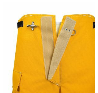
Hook & Dee closure on pants